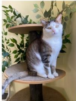
Avis – Adopted December 2023