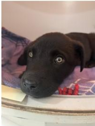
Murphy – Adopted May 2023