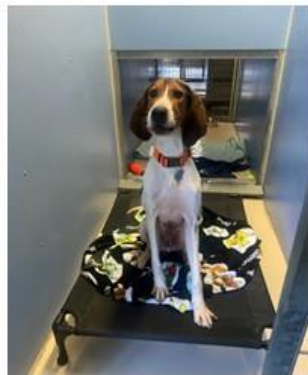
Oliver – Adopted March 2023