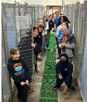
AmeriCorps Day of Service at the Sitka Animal Shelter, January 2024.