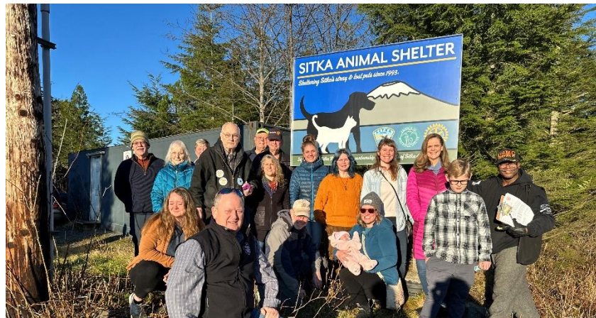
Unveiling of the new Sitka Animal Shelter sign, funded by Sitka Rotary Club and FOSAS, December 2023.