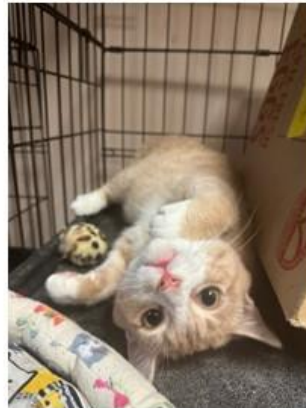
Winks – Adopted April 2024