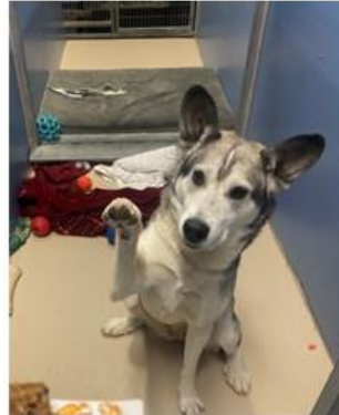
Xoodzi – Sent to SPOT Program in October 2023