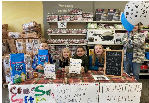
Donation drive for food and litter at AC Lakeside hosted by a local school group, October 2022.