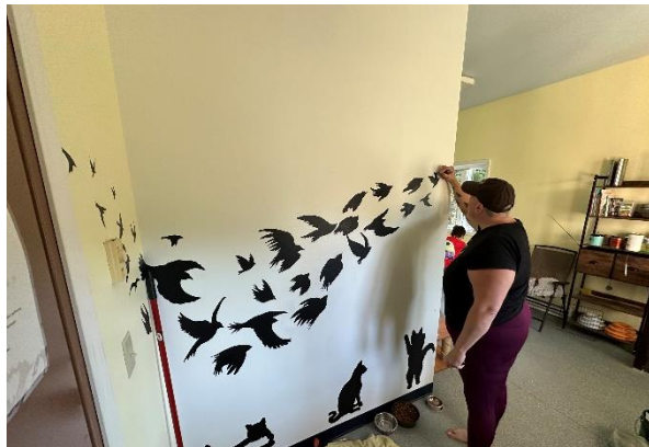
Renovations of the adult cat room with grant funding from the Alaska Community Foundation, November 2023.