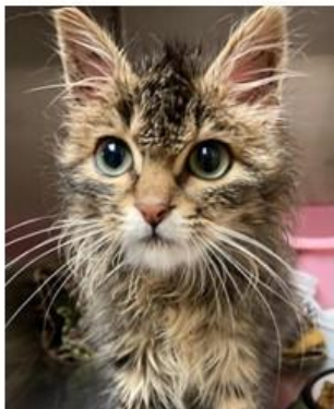
Miso – Adopted January 2022