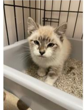
Orion – Adopted August 2023